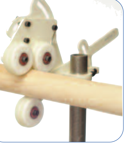
Spindle Steady Head Part No. 3308

Reducing the vibration along a spindle means a nicer finish to the piece (i.e. less time spent sanding) and a safer, more pleasurable turning experience.